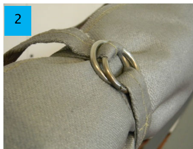
2 WRAP THE COVER AROUND THE JOINT