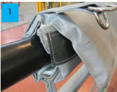
1 POSITION THE COVER AT THE CENTER OF THE JOINT